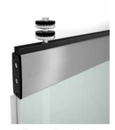
Top profile with rollers