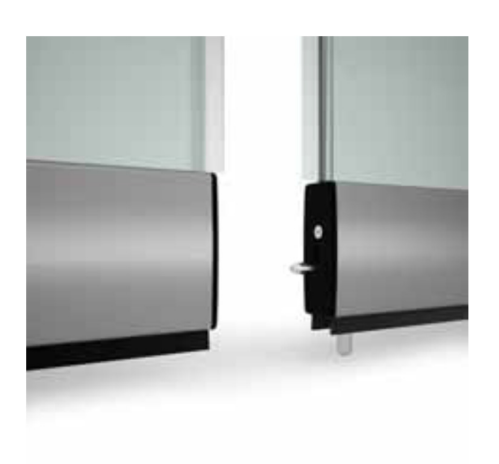
Bottom profile with locking device